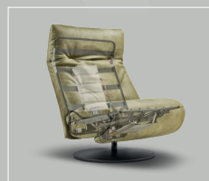
Piro with KS AirMassage